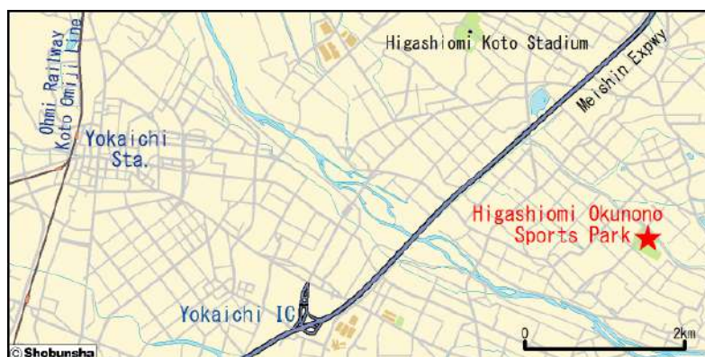
■ Higashiomi Okunono Sports Park