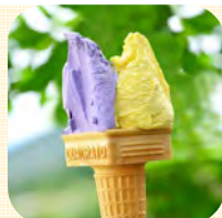
Miyama Milk & Sweets