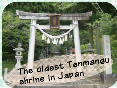
The oldest Tenmangu shrine in Japan