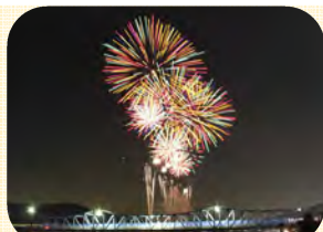
Nantan City fire works