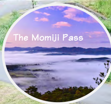
The Momiji Pass

Nantan City is located in the middle of Kyoto Prefecture and is easily accessible from Kyoto, Osaka and Kobe.