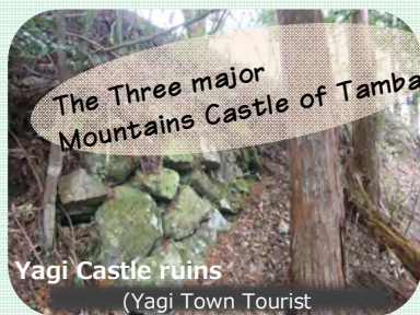
The Three major Mountains Castle of Tamba