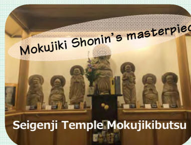
Mokujiki Shonin's masterpiece