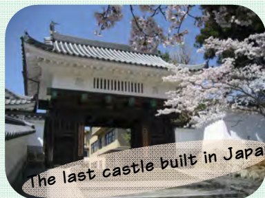
The last castle built in Japan